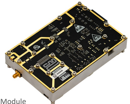
VDES1000 - Module

The VDES1000 is an optimised SDR based solution implementing a complete high performance VDES solution, whilst retaining the flexibility to support specific OEM/ODM needs and future evolution of the standard.